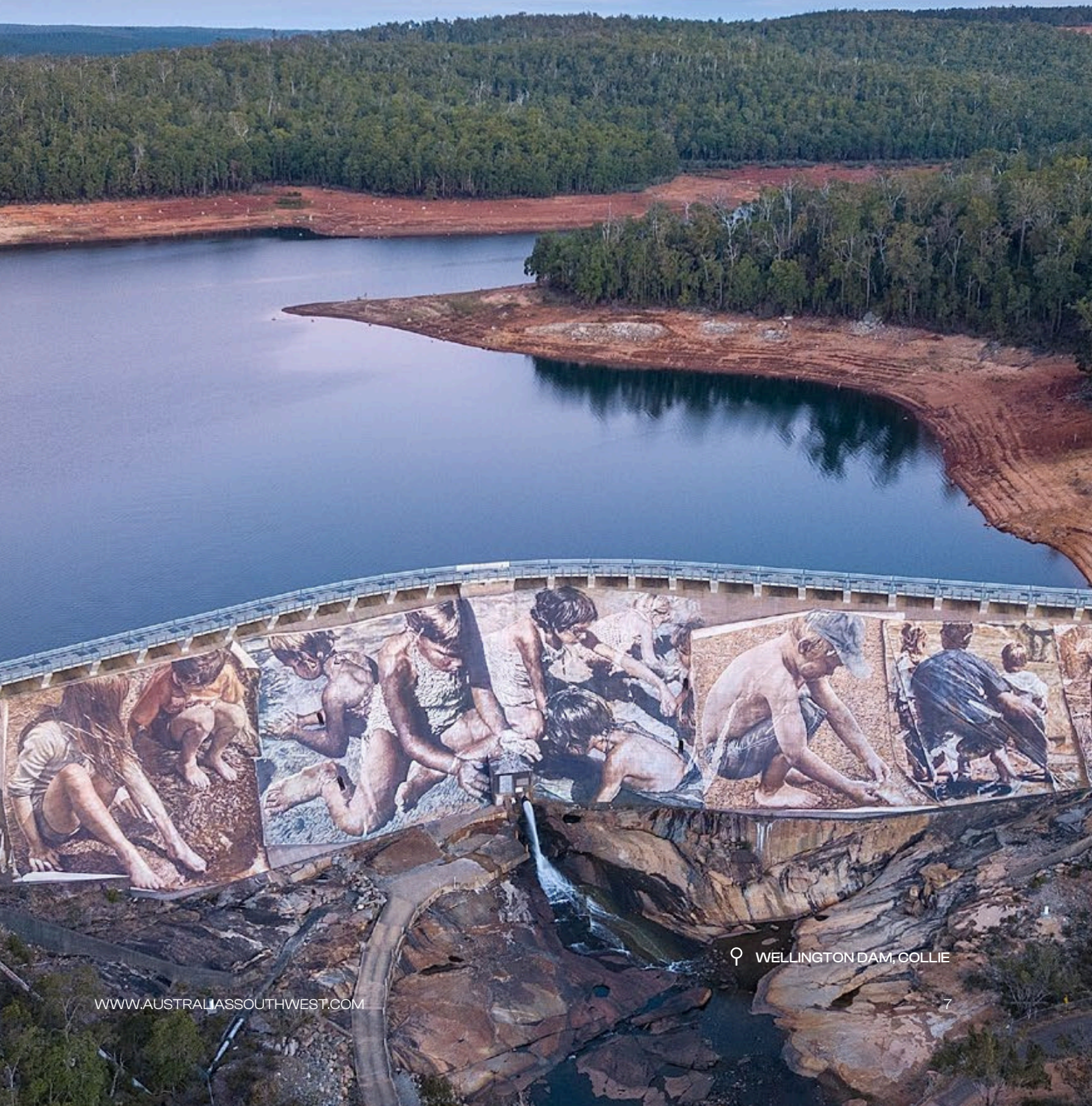
♀ WELLINGTON DAM, COLLIE

To help promote this aspirational travel phase to your clients, we've collated some of our top dream-like experiences. Combined, they showcase the best on offer in each of our four sub-regions: Bunbury Geopraphe, the Margaret River Region, Southern Forests and Valleys and the Great Southern.