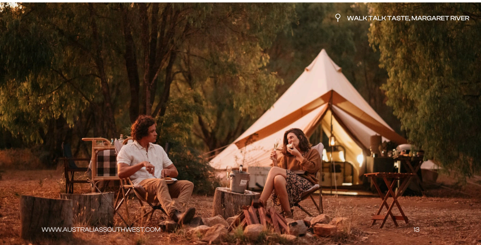
WALK TALK TASTE, MARGARET RIVER

Australia's South West aims to be an inclusive tourist destination, and as such, is continually developing products, services, amenities and infrastructure to allow everyone to access its beautiful sights and experiences. For more information on accessible tourism destinations in the South West visit bit.ly/SWaccessibility .